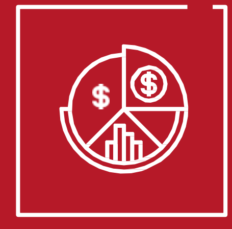
FACTS ABOUT THE POLISH COSMETICS SECTOR