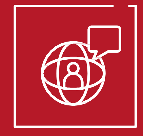
HOW WE CAN HELP YOU