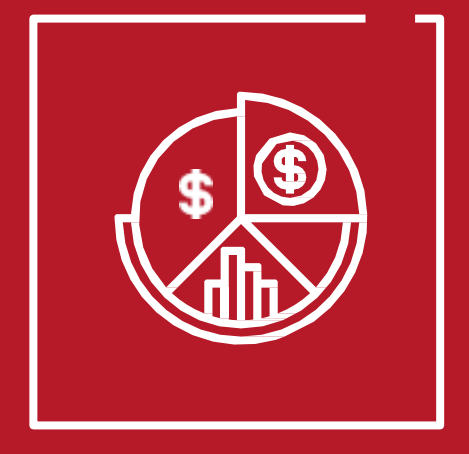
FACTS ABOUT THE POLISH CONSTRUCTION SECTOR