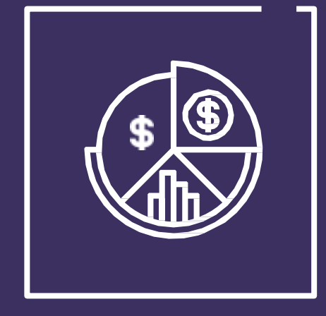
FACTS ABOUT THE POLISH GREENTECH SECTOR