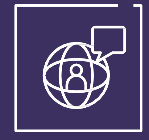
HOW WE CAN HELP YOU