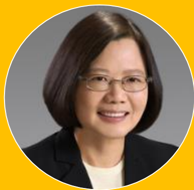
President of Taiwan Ing-wen Tsai