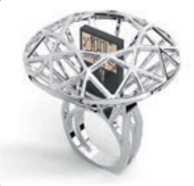
© Designer: Marcin Nowak

Industrial design is a medium of aesthetic values, it allows for the promotion of symbols, signs and traditions that create the identity of countries and nations. It helps to identify products with their home country. It also intensifies economic relations and is an important incentive for current and future trade exchange.