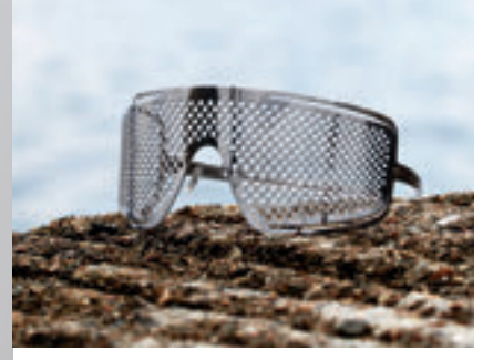
© Designer: Slav Novosad

The exhibition showcases over 450 products designed in Poland by over 100 companies and individual artists. Among the featured products are: jewellery, amber and black oak products, china, furniture, artistic and industrial glass, carpets, fixtures, toys, bicycles, interior design elements and many others.