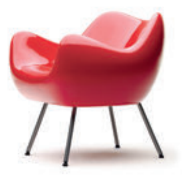
© Designer: Roman Modzelewski chair (RM58) by Vzór

Industrial design is a medium of aesthetic values, it allows for the promotion of symbols, signs and traditions that create the identity of countries and nations. It helps to identify products with their home country. It also intensifies economic relations and is an important incentive for current and future trade exchange.