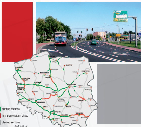
MAP: Motorways and express roads in Poland.