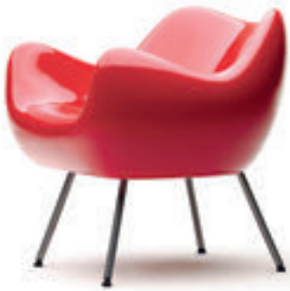
© Designer: Roman Modzelewski chair (RM58) by Vzór

Industrial design is a medium of aesthetic values, it allows for the promotion of symbols, signs and traditions that create the identity of countries and nations. It helps to identify products with their home country. It also intensifies economic relations and is an important incentive for current and future trade exchange.