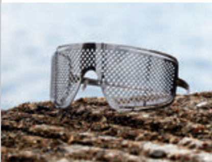
© Designer: Slav Novosad

The exhibition showcases over 450 products designed in Poland by over 100 companies and individual artists. Among the featured products are: jewellery, amber and black oak products, china, furniture, artistic and industrial glass, carpets, fixtures, toys, bicycles, interior design elements and many others.