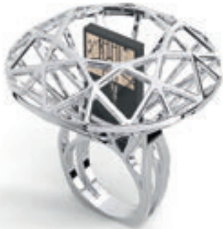
© Designer: Marcin Nowak

Industrial design is a medium of aesthetic values, it allows for the promotion of symbols, signs and traditions that create the identity of countries and nations. It helps to identify products with their home country. It also intensifies economic relations and is an important incentive for current and future trade exchange.